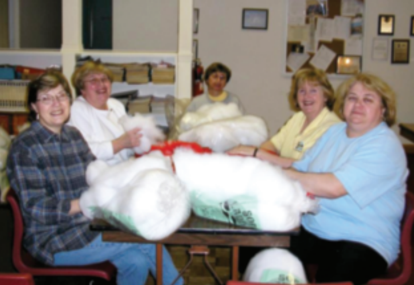
Pioneers stuff heart pillows which are used at local hospitals.