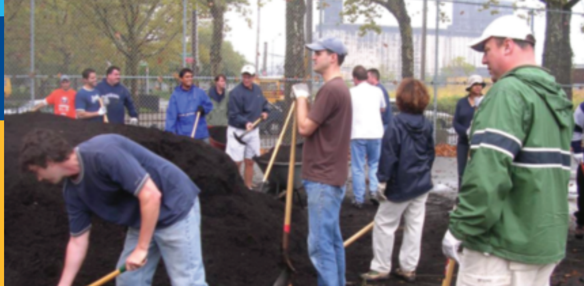
Pioneers give generously of their time to improve the community.

To change a mailing address, notify us of a deceased member, or if you have a question about Pioneer member benefits, please call the Pioneers resource center at 800-976-1914 or email us at info@telecompioneers.org